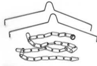
Hangers & Chain